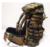
Main Pack (rucksack)