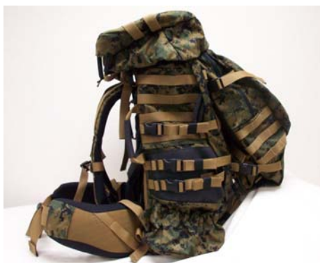
ILBE Pack System (Fig. 1)